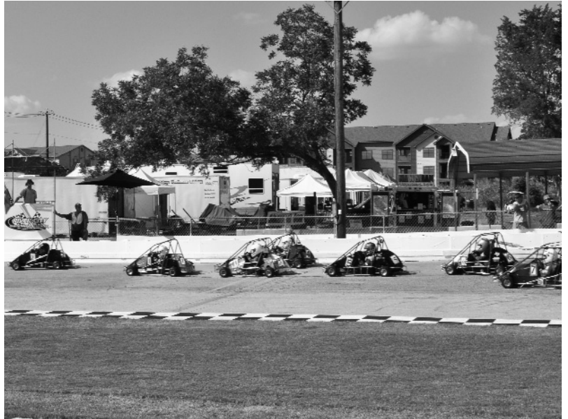
First Qualifier of the 2010 Western Grands was Ryan Ford - First Race was Senior Honda F Main